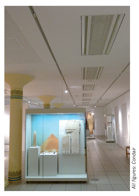
Figure 7 The outside air previously pre-tempered and humidified in the HVAC units is mixed with room air in the ceiling induction units, cooled in a water heat exchanger and then enters the exhibition rooms as supply air

cient circuit connected system (KVS), before being extracted into the exhaust air. This exhaust air heat exchanger is coupled via a heat transfer fluid with a heat exchanger on the supply air side, which preheats the entire outside air volume flow with the exhaust heat in the winter time or pre-cools the air volume flow in the summer time. Only after this central pre-tempering, the outside air is distributed to the individual