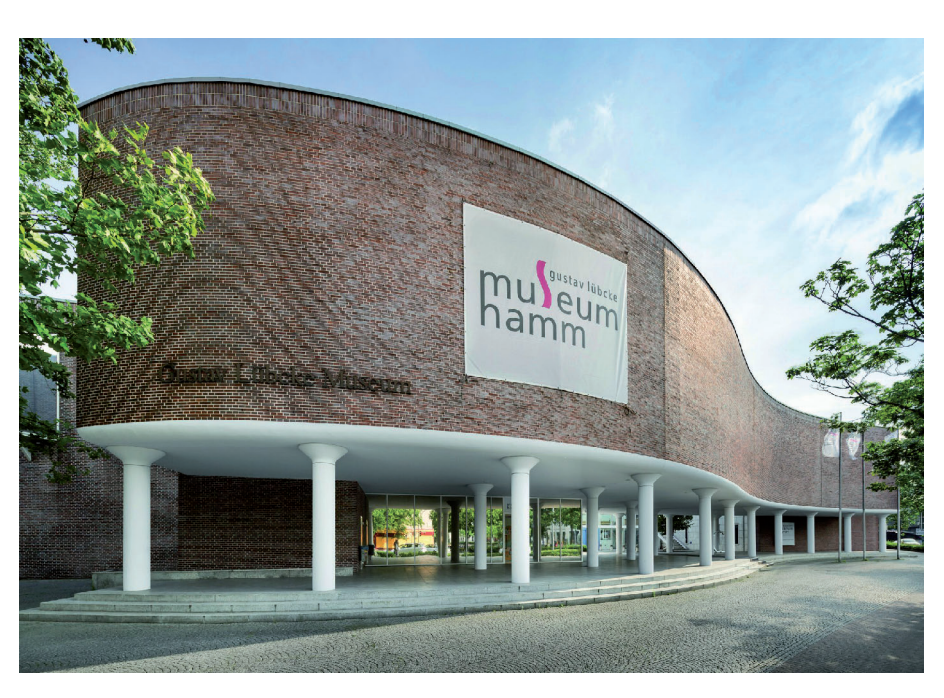
Figure 1 In the course of an extensive modernization, the Gustav-Lübcke-Museum in Hamm received a total of eleven HVAC and central air conditioning units with a total air flow of 90,000 m³/h

"The new air conditioning systems using constant air and humidity settings in the exhibition rooms are the prerequisite for us to remain competitive in the future and bring attractive exhibitions and valuable loan collections to Hamm". This statement by the management of the Gustav Lübcke Museum in Hamm underscores the enormous importance of modern and energyefficient air conditioning technology for the operation of museums. Condair's new air conditioning systems with multi-humidification solutions were installed during a major modernization of the museum.