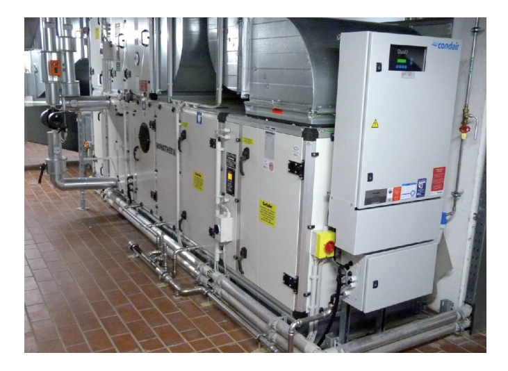
Figure 5 Two central air conditioning units with air outputs of 7,500 m<sup>3</sup>/h each were installed on the roof of the museum. On the top left is one of the two gaspowered Condair steam humidifiers