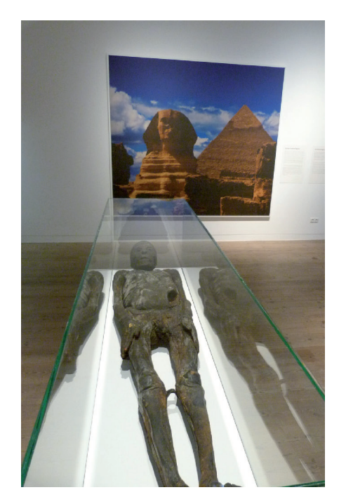
Figure 2 The special exhibition "Mummies — The Dream of Eternal Life" included more than 100 exhibits